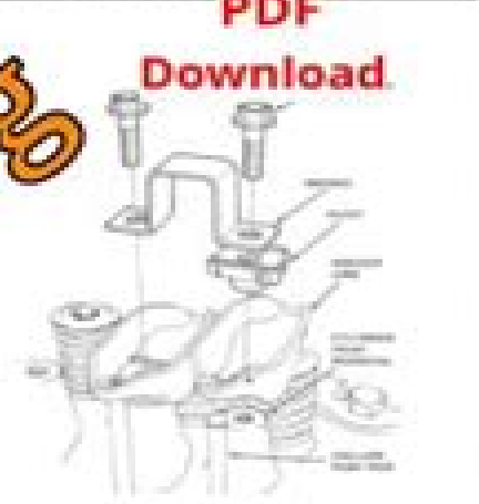
Fig. 2-19 Bridge-type rocker arm assembly (continued)