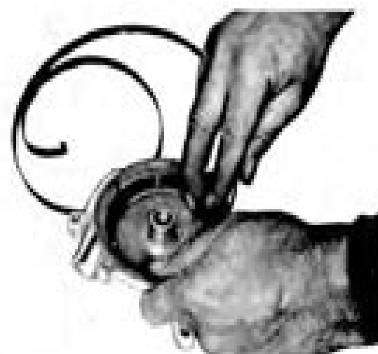
Figure VII-12. Wind the starter spring into the base in a counterclockwise direction. Spring ends are purposely annealed to assist in making spring conform to drum and base at the anchor ends.