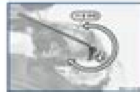
Put special tool (1) on the alternator.

Apply special tool (2) and (3) on the alternator.