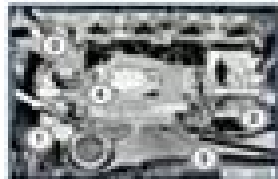
Remove mounting bolt (1) for the alternator and remove the alternator (2).