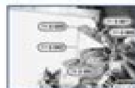
Remove the alternator (1) from the engine (2).

Remove the alternator from the engine (5) from the engine (6) from the engine (7).