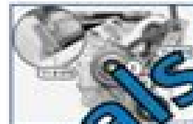
Remove the alternator (1).

Note: Make sure the alternator is not damaged.