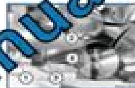
Remove mounting bolt (1) from the alternator and remove the alternator (2).

Remove the alternator (8) from the engine (9).