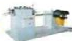
Sterilizing Machine Decoiling Machine