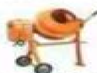
1/2 Bag Mini Mixer