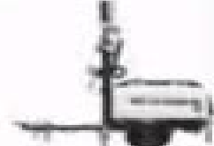
Mobile Light Tower