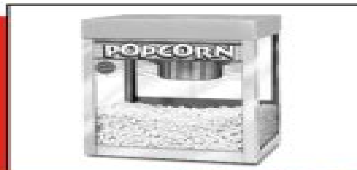
MPC-1A Popcorn Popper