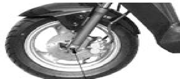
Front Axle Nut