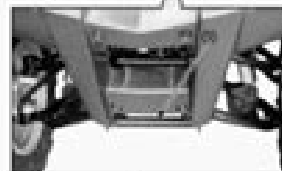
(1) Location of Frame Serial Number