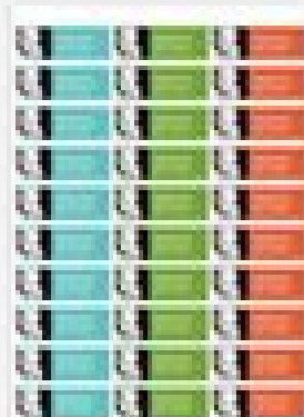
Photo address labels