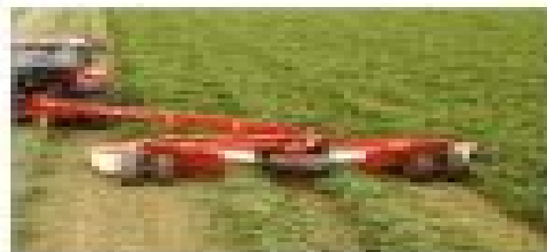
Working in the field