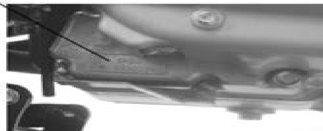
Location of Engine Serial Number