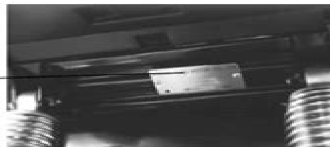
Vehicle Identification Serial Number