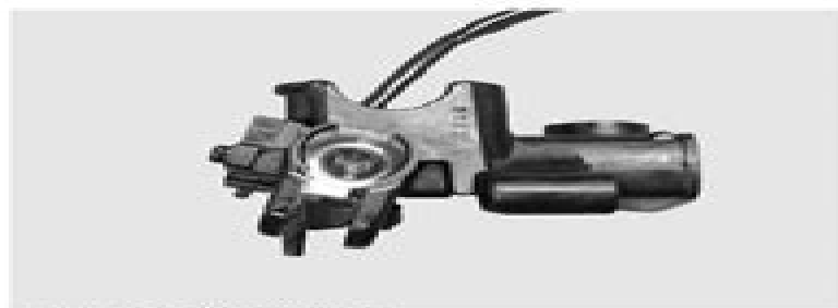
Remove cups for wear.