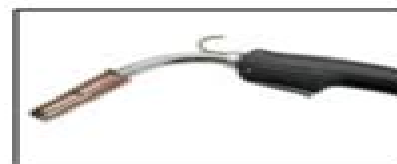
Extra Length 15 ft. (4.5 m) gun