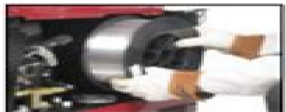
Accessible Wire Compartment