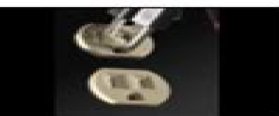
115 Volt AC Auxiliary Power

Compare These Innovations – Make the Professional's Choice™!