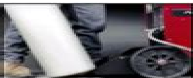
Easy Load Gas Cylinder Platform