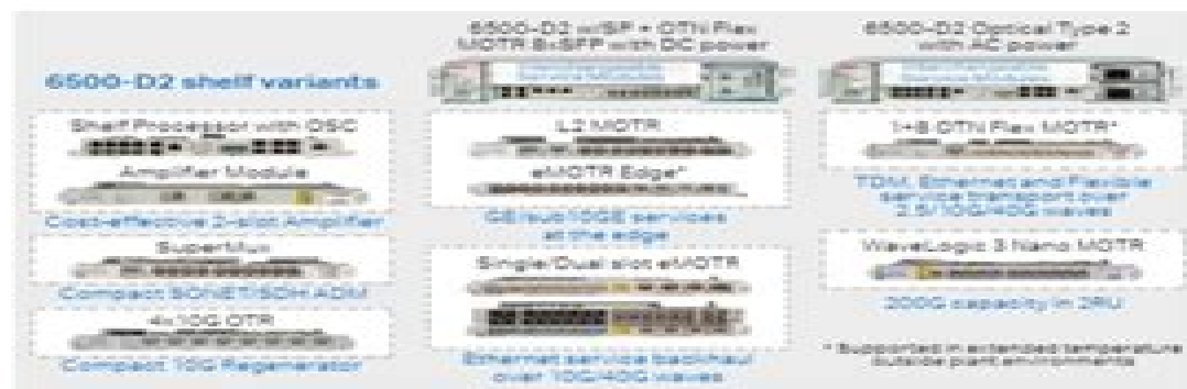
Figure 1. 6500-D2 Flexible configurations for various small office applications.

The 6500-D2 is a 2RU chassis composed of two service card-carrying slots enabling customized configurations for the strictest connectivity requirements at the access edge. The 6500-D2 offers AC and DC powering options, providing flexibility to meet customer premises power requirements, as well as backplane connectivity between the service card slots offering increased scalability and service resiliency options. Additionally, its small footprint and light weight enable field installation by a single person at locations with limited real estate.