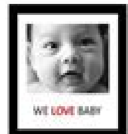
Baby photo album