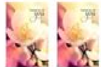
Thinking of you cards