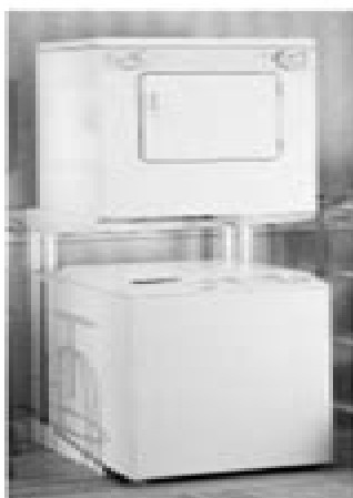
Shown with optional Stack Stand