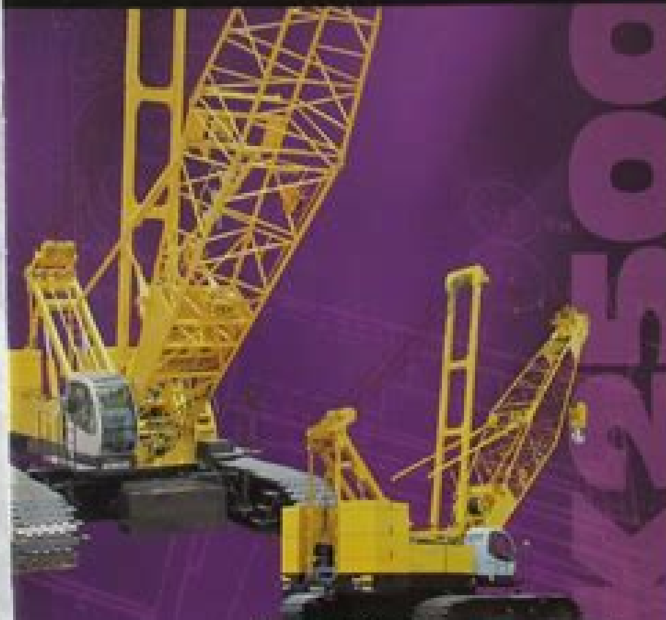
HYDRAULIC CRAWLER CRANE

MAX. BOOM + LIFTING JIB 200 ft. + 170 ft.