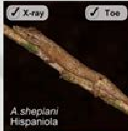
A. sheplani Hispaniola