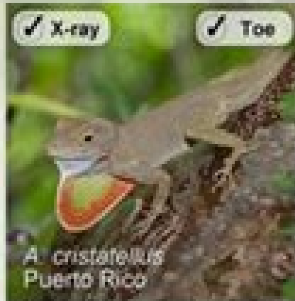
A. cristatellus Puerto Rico