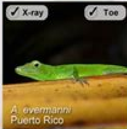
A. evermanni Puerto Rico