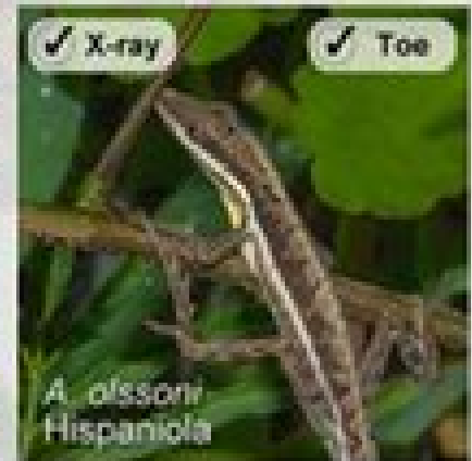
A. olssoni Hispaniola

Press each lizard photo above to measure. You can review how to take measurements by pressing on the "Tutorials" tab.