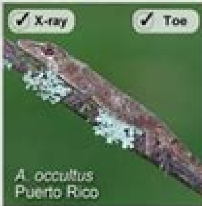
A. occultus Puerto Rico