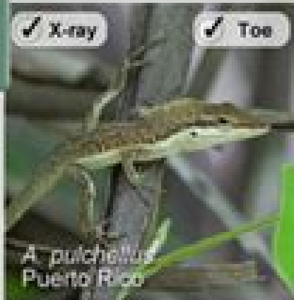
A. pulchellus Puerto Rico