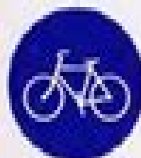
COMPULSORY CYCLE TRACK/CYCLE ONLY