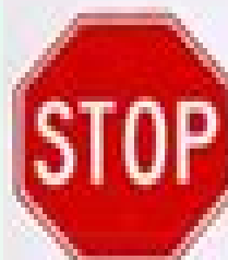
STOP SIGN *