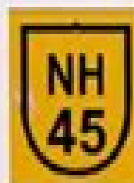
NATIONAL HIGHWAY ROUTE MARKER SIGN