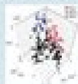
Fig. 1 Flow diagram of near-infrared (NIR) spectroscopy for species authentication and geographical origin discrimination of herbal medicine. NIR: Near-infrared spectroscopy; HM: Herbal medicine; GA: Geographical origin; SA: Species authentication.

1. Pei Wang, Zhipan Ye* Species authentication and geographical origin discrimination of herbal medicine by near infrared spectroscopy: A review. Journal of Pharmaceutical Analysis , 2015, 5(3): 277-284.