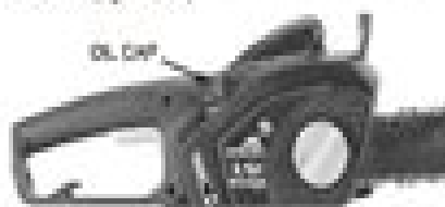
OIL TANK (NOT TO BE FILLED)

The oil tank level should be frequently checked during operation to avoid starving the bar and chain of lubrication. NOTE: Your chain saw is equipped with an Automatic Oil system and is the ONLY source of lubrication for the bar and chain (Figure 3-5A).