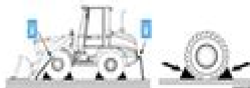
Fig. 355 Loading points