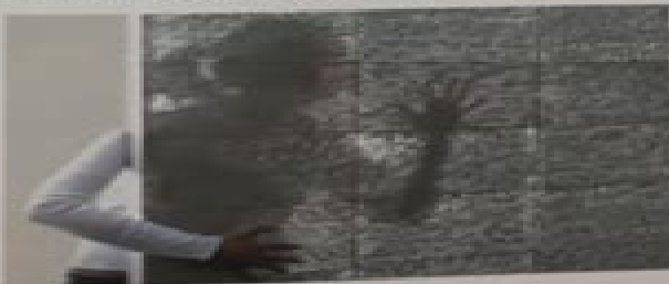
Béton transparent pour la construction

Un matériau dit « intelligent » modifie ses propriétés physiques et peut interagir avec son environnement en captant des signaux.