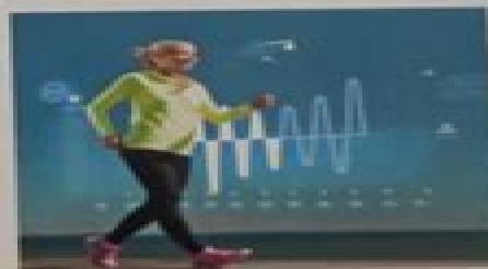
Vêtement connecté pour le sport