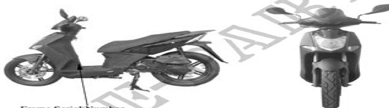
Frame Serial Number