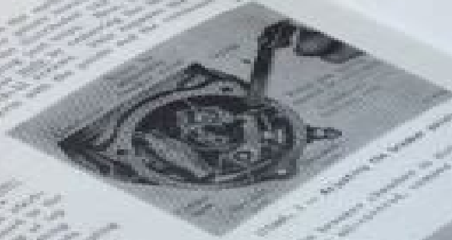
Figure 1. Ignito Lowdown. The Ignito Lowdown is a comprehensive guide to the world of lowdowns. It covers everything from the basics of lowdowns to the most advanced techniques. The book is written in a clear, concise, and easy-to-understand style. It is a must-read for anyone who is interested in lowdowns.

The Ignito Lowdown is a comprehensive guide to the world of lowdowns. It covers everything from the basics of lowdowns to the most advanced techniques. The book is written in a clear, concise, and easy-to-understand style. It is a must-read for anyone who is interested in lowdowns.