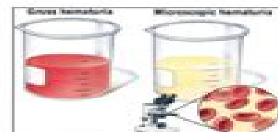
Figure 1. Hematuria