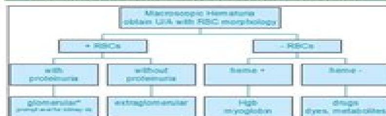
Figure 3. Simplified algorithm for hematuria