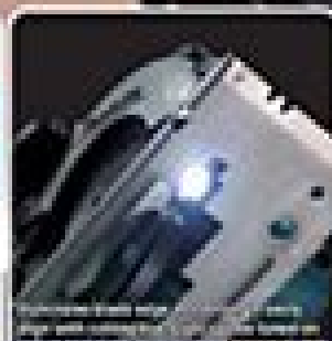
Twin LED Light