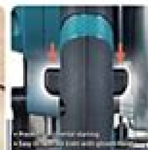
Large Lock-off Lever