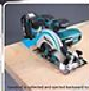
Sawdust Ejection Backward Function