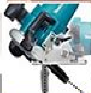
50 degrees Max. Bevel Capacity