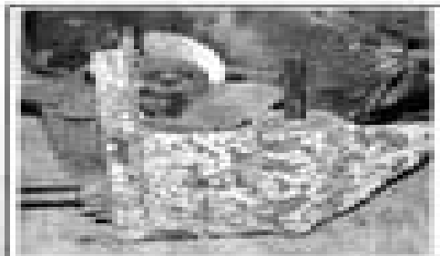
Fig. 9 This lower unit has been left in the water for too long. It had been left in the water for too long with very little if any maintenance done to it.