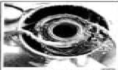
Fig. 8 Excellent view of rope and fishing line entangled behind the propeller. Exposed flapping line was actually cut through the seal, allowing water to enter the lower unit and lubricant to escape.