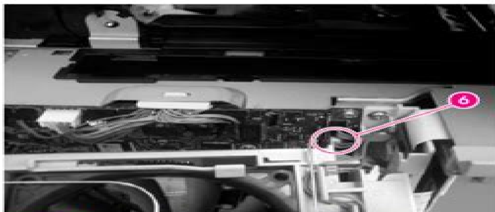
Figure 6-94 Remove the tray 1 feed-assembly (11 of 13)