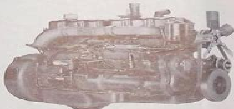
Right side of Thermodyne diesel, showing injection pump and governor, air compressor, three-piece exhaust manifold and breather caps mounted on valve covers.

Of the basic open-chamber, direct-injection type, the combustion system achieves these results by a new combination of features of established merit. Outstanding among these is its deep-breathing, high-velocity air swirl. This, combined with an improved multiple-unit injection system, operating at moderate pressure, produces high thermal efficiency and therefore sustained economy through a broad range of useful speeds. Smooth and flexible operation result from the Synchrovanze which automatically controls injection timing for