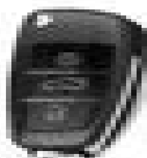
Front view (China)