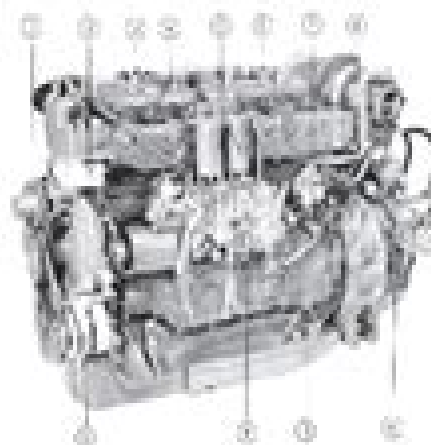
Fig. 4 Engine TAMD60, TAMD70C

The fuel system is well protected from interruptions during running by means of an electric, replaceable fuel filter. On the TAMD60 engines the fuel injection pump is large mounted under the other engine from the pump fitted on a bracket.