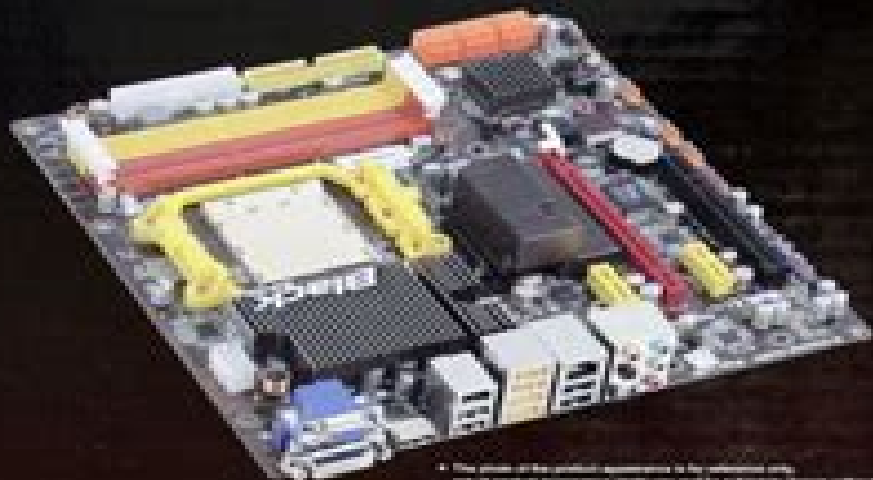
* The price of the product depends on the selected chip. * Each product is warranted against only one year of limited warranty.