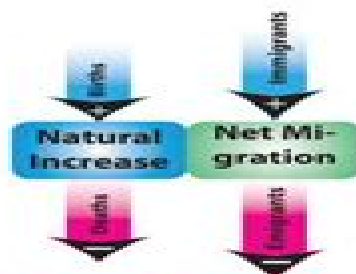
Figure 4.7: Population change