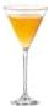
Cidre (20cl) 80 KCAL