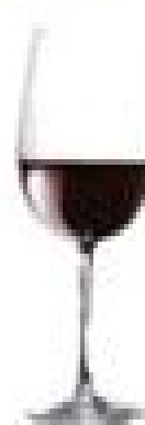
Vin rouge (12,5cl) 106 KCAL