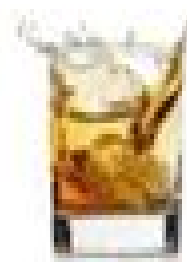
Whisky (4cl) 87 KCAL