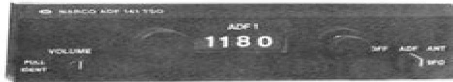
ADF 141 RECEIVER