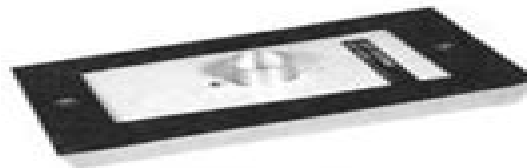
ADF 141 ANTENNA