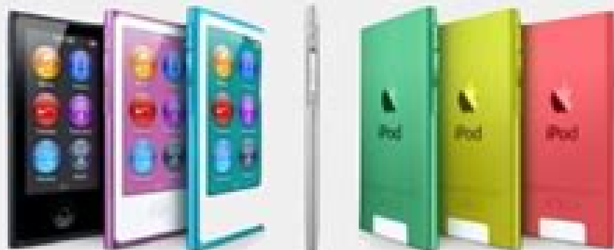
New iPod nano