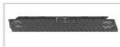
BA: Bracket Accessory