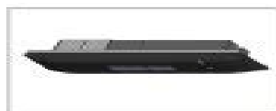
CA: Ceiling Accessory