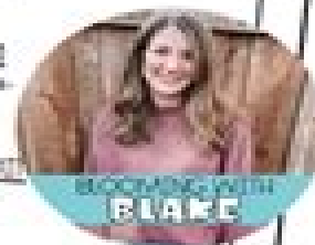
BLOOMING WITH BLAKE