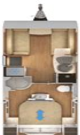
LEXON 590 4 Berth