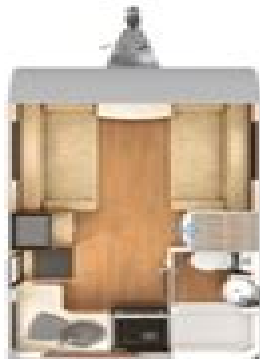
STELLAR 2 Berth