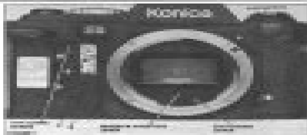
Fig. 21. Front view - zoomed