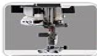
Enhanced Superior Needle Threader