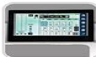
7" Color LCD Touchscreen