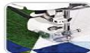
A.S.R. (Accurate Stitch Regulator)