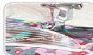
Ruler Quilting Function