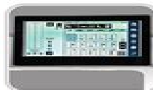
7" Color LCD Touchscreen