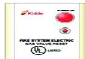
Figure 2. Manual Reset Relay, P/N 60-9101735-000

The Electric Gas Valve and Manual Reset Relay must be specifically listed for use with the Kidde WHDR or IND suppression system.