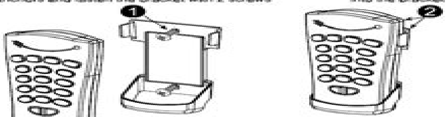
Figure 2 - Mounting

Drill 2 holes in mounting surface, insert wall anchors and fasten the bracket with 2 screws