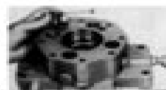
Fig. 2 - Tractor basic assembly, front view

The tractor is designed to operate in the following conditions: - In the field, on rough terrain, and in the yard. - In the field, on rough terrain, and in the yard. - In the field, on rough terrain, and in the yard.