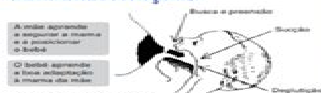
Figura 2 - Reflexos do bebé