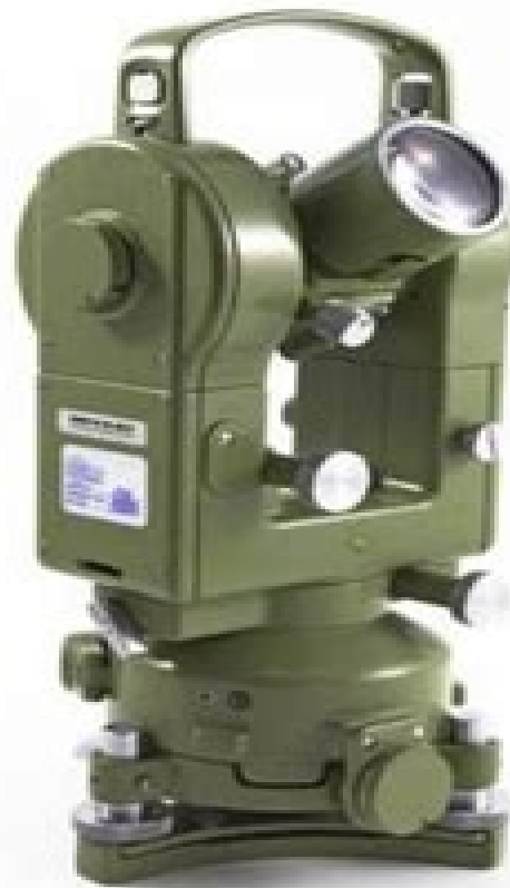
T2 Theodolite Wild