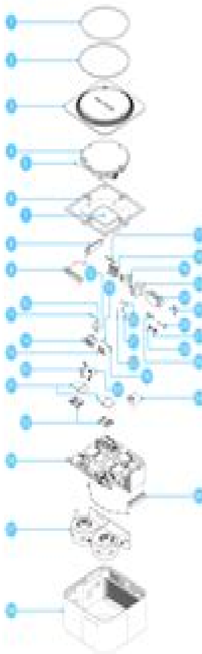
Mac Studio (2023)