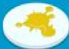
Mucus in the Stool