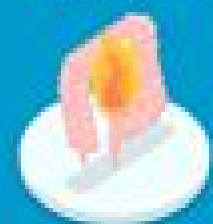
Inflammation in the Intestines