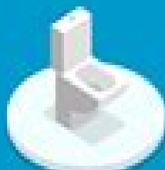
Diarrhea or Constipation