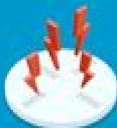
Abdominal Pain, Cramping or Bloating