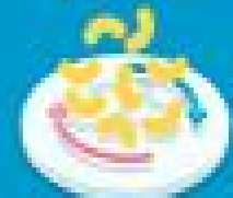
Changes in Microflora