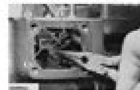
(g) Crankshaft Gear (h) Camshaft Gear